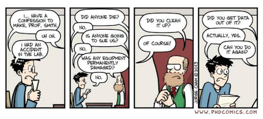
FIGURE 3-1 Complexities of student perceptions of where lab safety ranks. http://www.phdcomics.com/comics/archive.php?comicid=1613. Accessed November 6, 2013. Used with permission from "Piled Higher and Deeper" by Jorge Cham www.phdcomics.com.